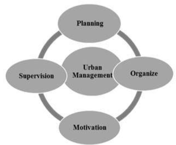
Fig. 2. Urban management tasks and their relationship with each other ( Imani Jajermi, 2020 ).

Finally, it can be expected, urban management has similar features in comparison with planning such as existing various dimensions that contribute to many subjects. One of the most important plans to beautify the sustainable urban landscape is to notice the expansion and protection of green spaces, which is considered an important measure in terms of landscape management.